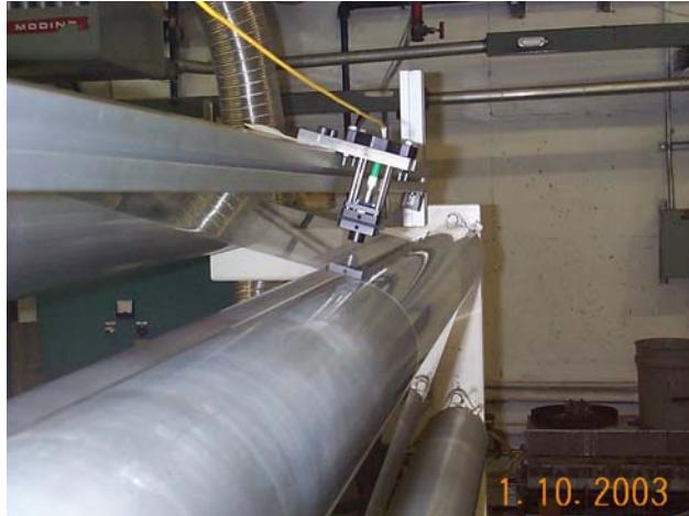
Figure 1: Probe setup

The dual interferometer was consistently measuring 80 microns optical thickness, 53 microns physical thickness across all speeds. An adjustment was later discovered that accounted for the one-micron difference in these sets of measurements. Additional measurements were taken and verified via micrometer gauges and a beta gauge.